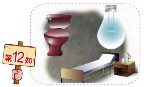
Tip 12. Use the toilet before going to bed to reduce your night-time trips to the toilet.