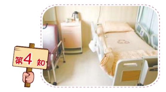
Tip 4. Put staff on the bedside desk cabinet to keep the pathway clear. Keep items you use frequently (such as call bells, toilet paper, urinals ...) in easy-to-grab spaces.