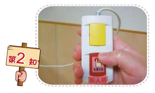
Tip 2. When you are alone and need help, please ring the call bell to call help.