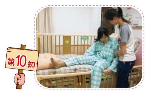
Tip 10. The correct way to get out of bed: get out of bed from the side of your healthy part of body. For example, if you are paralyzed on the right side of the body, you should get out of bed from the left side of the bed.