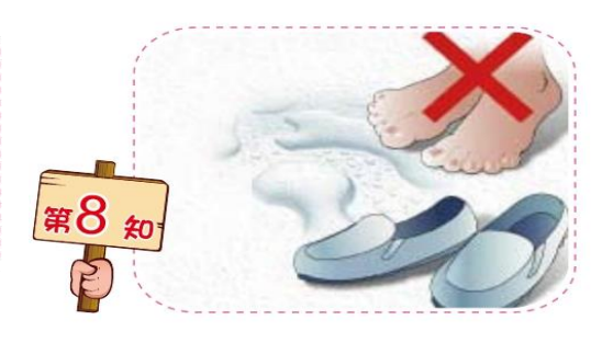
Tip 8. Please wear anti-slip shoes; do not walk barefoot.