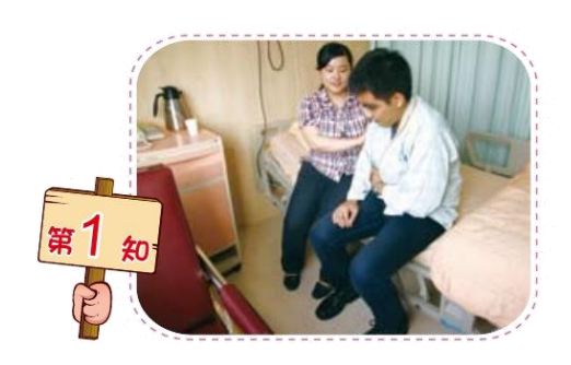
Tip 1. For getting out of bed, you should first sit on the edge of the bed and put your feet on the floor for a few minutes, and then get out of bed with the help of your family.