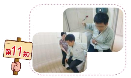
Tip 11. Get assistance when using the toilet. Do not stand up by yourself. If there is an emergency, please ring the emergency bell.